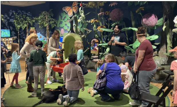
Photo of Braille Games participants learning about trees and their leaves

Braille Games, held on May 16th, was an amazing success. Thirty-five children from Milwaukee Public Schools and ten surrounding school districts participated, including five first-timers from the Wisconsin School for the Blind and Visually Impaired. Studying leaves with braille labels, writing stories about life in the "olden days" and learning about animals native to Wisconsin were some of the fun activities. The braille and tactile book The Wonders of Wisconsin , written by Milwaukee Public Museum staff, produced by ABLE staff and given to all participants, has amazing tactile graphics, including animals, different types of leaves, and items used in the early 1900s.